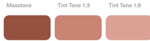
FERROXIDE Orange 4535P

Colors Represent Mass Tone and Tint Tone 1:3 / 1:9