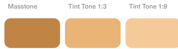
SICOVIT Yellow 10 E172

Colors Represent Mass Tone and Tint Tone 1:3 / 1:9